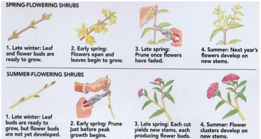
Miracle-Gro Guide to Growing Stunning Trees & Shrubs

Pruning in early spring allows plants to recover quickly and stimulates growth. Early spring is the best time to prune summer-flowering trees and shrubs. Spring flowering plants and shrubs should be pruned after they have flowered in the early spring. Prune each type of plants the same way, just at different times.